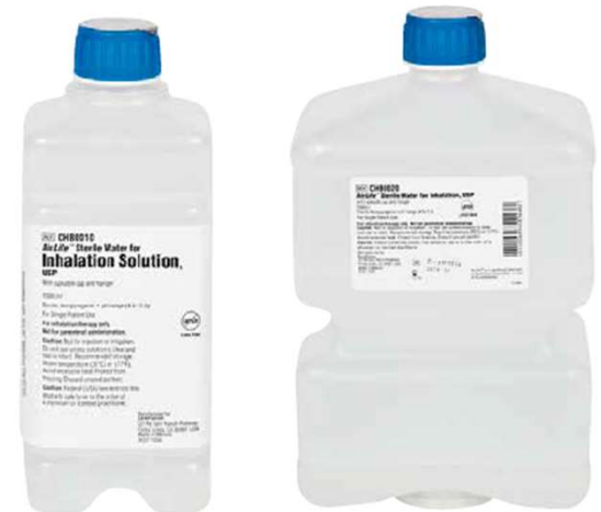
Hanging Bottle ---

Cross Sell: AH Circuits, filters, HFNC, NIV Masks