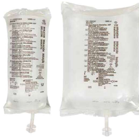
--- Flexible Bag

Product Codes: 2D0735X, 2D0737, CHB0010, CHB0020