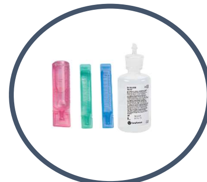
Modudose & Irrigation