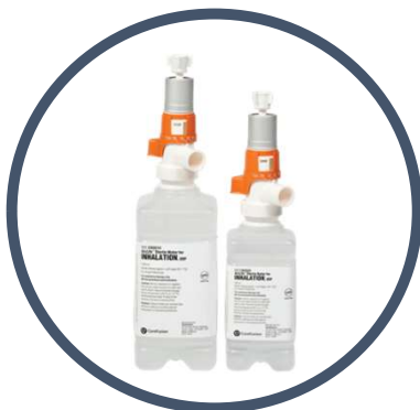
Lg. Volume Nebulizer