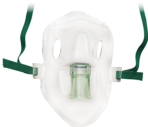
001206 Adult aerosol mask