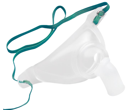
001226 Adult tracheostomy mask