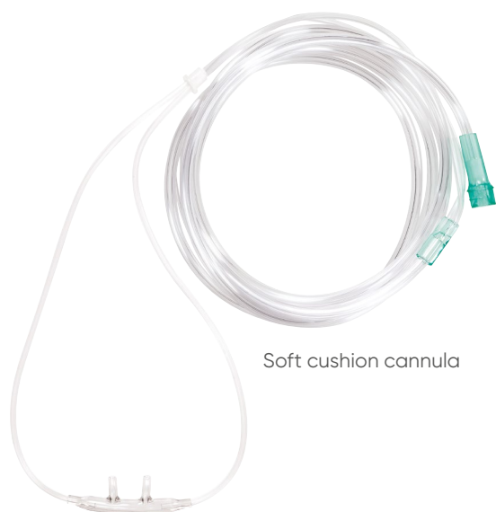
Soft cushion cannula