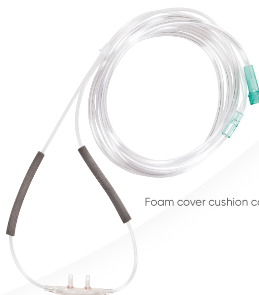
Foam cover cushion cannula