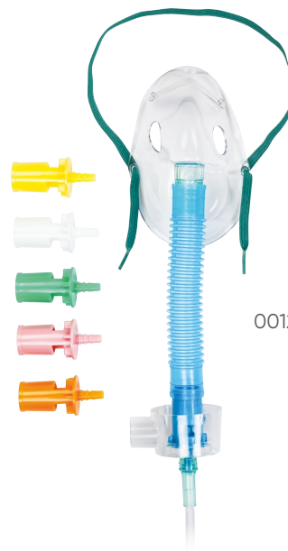
001240 Adult Venturi-style mask

We offer a wide selection of both standard and Dual Dial™ Venturi-style masks that feature either six diluter jets or two oxygen concentration dials. All masks are under-the-chin style and supplied with a six-inch flextube, humidification hood and seven-foot crush-resistant tubing. We also offer a Venturi-style with a tracheostomy mask for use with a 50 psi oxygen source and flowmeter.